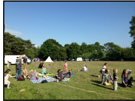
Making good use of our huge field!