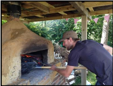
Busy cooking pizzas!

Hamsey School is at the heart of the local community. Each year the school takes a leading role at Hamsey Festival and displays art work at Cooksbridge Station, as well as taking part in the Lewes PATINA parade. Last summer we also used our field for a community pizza and camping night, using our own clay oven for cooking the pizzas.